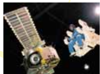
GMMU Jr. (Ground Mounted Manned Maneuvering Unit) Reach for the satellite!