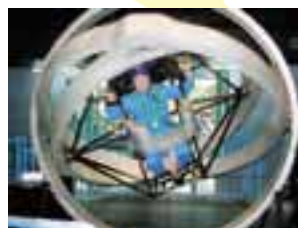
Multi-Axis Trainer Don't get too dizzy!