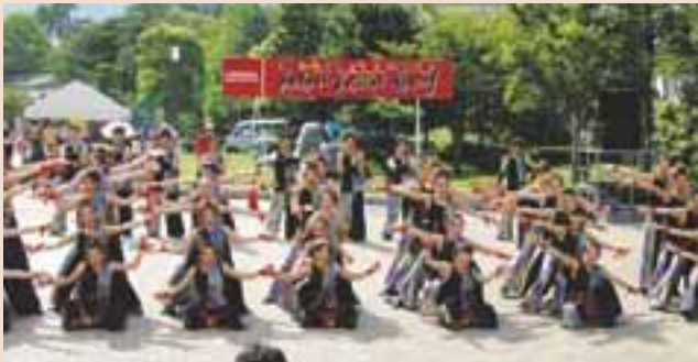
Winner of this year's competition

The Yosakoi Kitakyushu Troops have once again competed at the Wasshoi Summer Festival this past August and received great responses from both the local and foreign visitors. Please join the fun next year and let's all dance the night away!