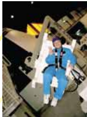
MMU, Manned Maneuvering unit. Nice peace sign!

Space World will be holding fun events for children to commemorate the two international space conferences that will be held this year in October. Visit Space Camp and all the exciting programs will be waiting for you!