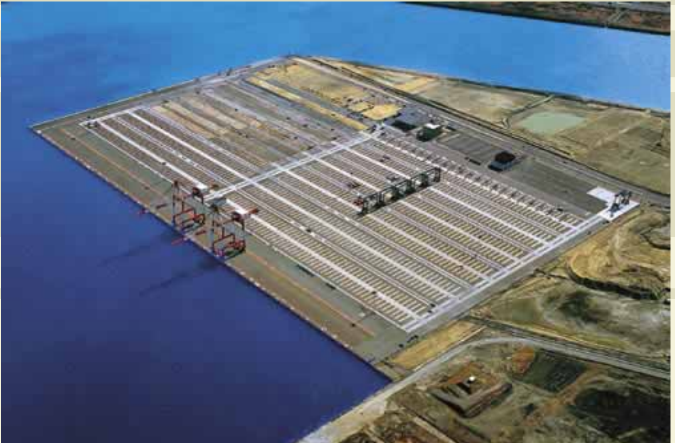
Aerial view of the Hibiki Container Terminal

The much-awaited Hibiki Container Terminal opened in the Wakamatsu Ward of Kitakyushu on April 1, 2005, which will serve as one of Japan's mega terminal capable of calling in large amounts of containerized cargoes from Asia, North America and Europe, and highly anticipated to further the nation's economy and industries.