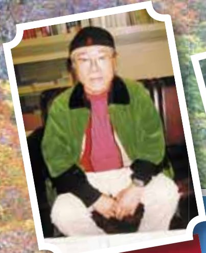
Leiji Matsumoto Exclusive Interview!