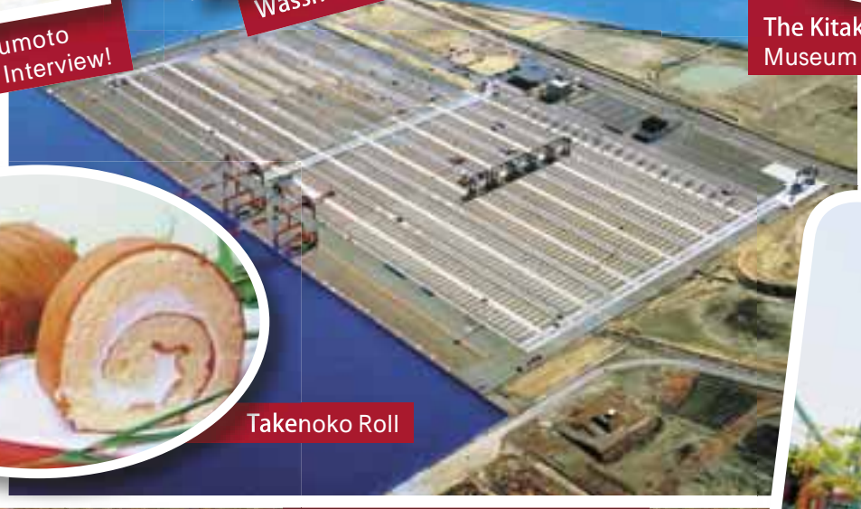
Hibiki Container Terminal