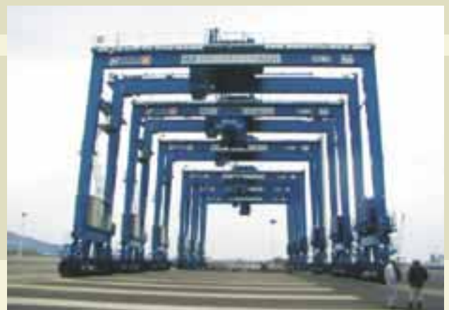
TRANSFER CRANES, each measuring 20m in height and 25m in width. 16 tires are attached to each crane, capable of moving around the yard on its own, as well as loading/unloading the containers.

Besides being the only terminal that holds the deepest pier (a water-depth of 15 meters) on the Japan Sea side and Kyushu, the Hibiki CT permits large-scale modern container