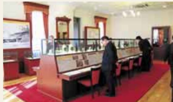
The Showa-Heisei Roman Room

star-shaped swing bell where couples can make wishes, the Showa (1926-1989)- Heisei (1989-present) Roman Room has a display of posters and information on the start of the Japanese brand beer. There’s so much to learn so come on down to Moji Ward and visit the Beer Masonry Museum and you will surely become a beer expert!