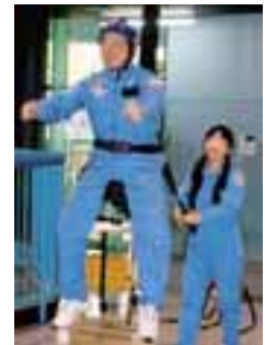
Moon Walker You can be like Neil Armstrong!