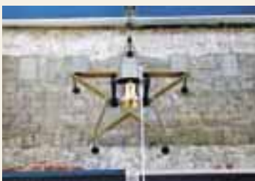
Star-Shaped Swing Bell-A Wish Granter for Couples

The Roman (Japanese for “Romantic”) Observatory Room on the second floor has a