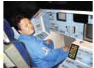
Inside Shuttle Simulator (Discovery) Liftoff!