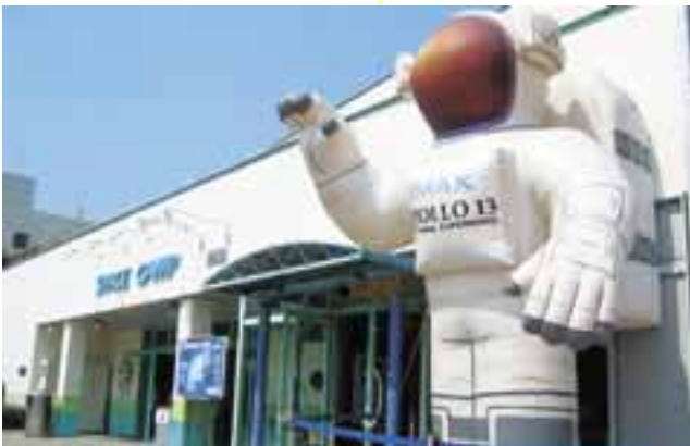
Space Camp, constructed under a license agreement with the U.S. Space Camp Foundation

Have you ever wanted to travel into space? Or even walk on the moon? Granted! Japan's only space-themed amusement park, Space World , will take you to Space Camp, which is the nation's first full-scale educational facility for space experience, and lets you try all the real action-packed flying-maneuvering-moon-walking-swirling training program similar to the ones real NASA astronauts go through before they go up in space. It offers you a total of eight exciting rides that include the Moon Walker, a ride that is designed to support 5/6 of your weight to make you walk like you are actually on the moon! You can also come onboard the Shuttle Simulator (Discovery), and be your own Captain!