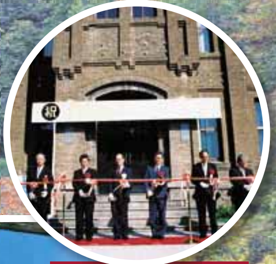
The Kitakyushu Beer Masonry Museum in Moji