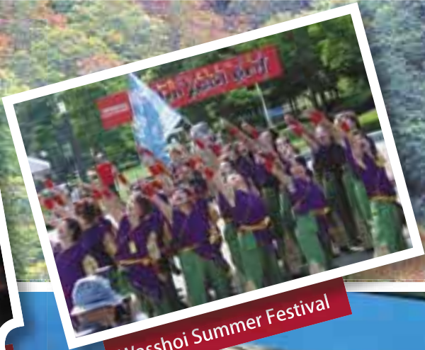
Wasshoi Summer Festival