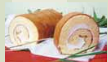
Takenoko (Bamboo Shoots) Roll...SCRUMPTIOUS!

TAKENOKO ROLL: 735 yen (tax included) Where can I buy them? At Bretzel 2:3:2 Address: 20-3 Kurobaru 3-Chome Kokurakita Ward Tel: (093) 951-8829