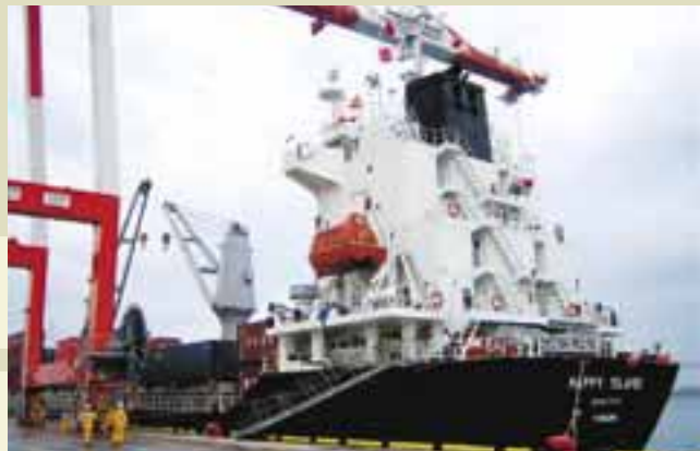
HAPPY ISLAND makes her first port call at the Hibiki Container Terminal

The Hibiki CT is the Phase 1 Project of the Hibikinada Hub Port Plan, and one of the biggest projects in the ongoing Kitakyushu Renaissance Plan. The opening of the Hibiki CT will take Kitakyushu to the next level as a vibrant and powerful city.