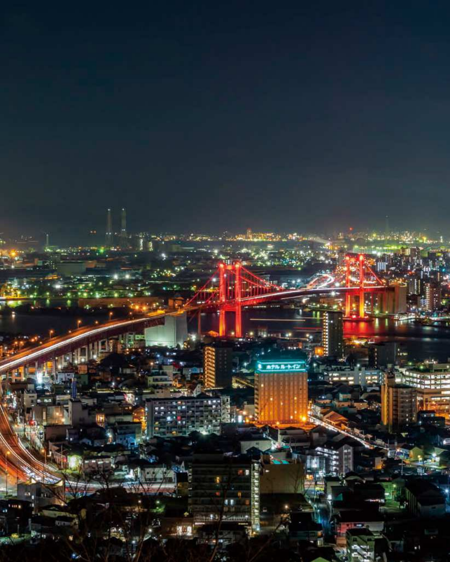
87 A view from the Mt. Takato observatory at night