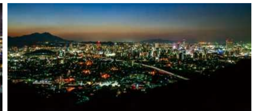
86 A view from Mt. Adachi at night