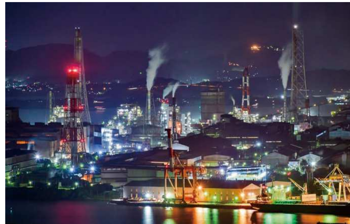
88 A view of a plant at night (Tobata area, as seen from the Mt. Takato observatory in Wakamatsu District)