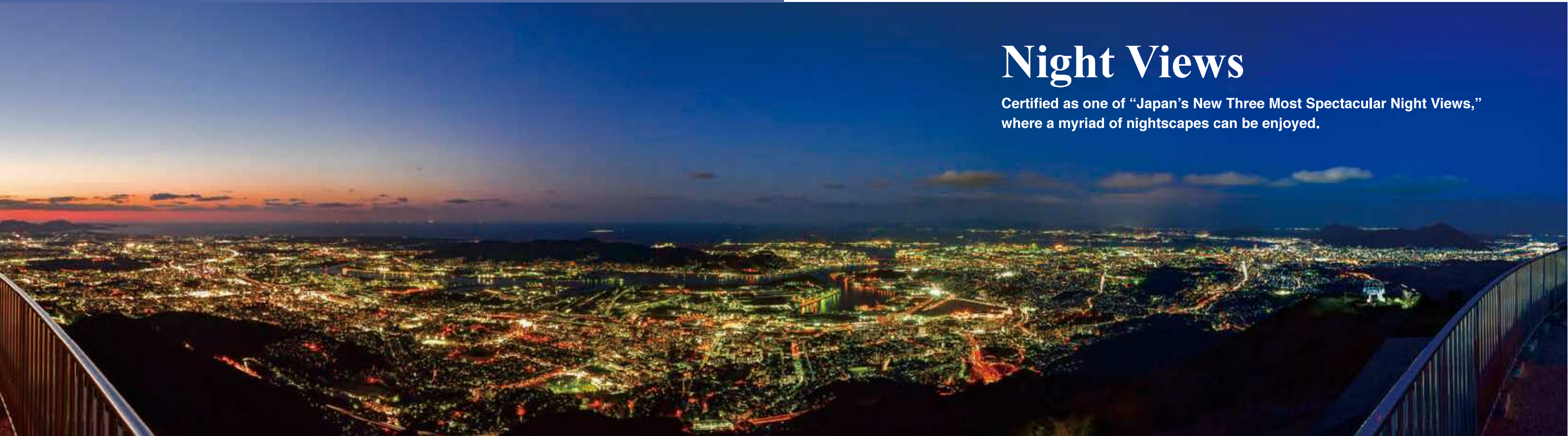
83 Sparking lights as seen from Mt. Sarakura

Certified as one of “Japan’s New Three Most Spectacular Night Views,” where a myriad of nightscapes can be enjoyed.