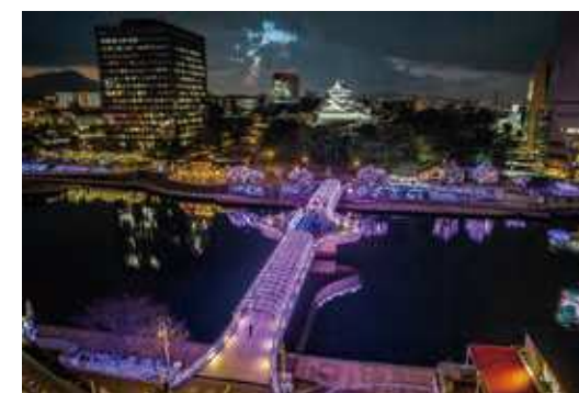
85 Kokura Illumination

Kitakyushu provides charms in abundance in its many ways of appreciating scenery, including the “Kokura Illumi-nation,” a winter event held in various locations throughout the city, such as JR Kokura Station and by the Murasaki River, and the “Night View Cruise” for enjoying the dynamic view of factories at night.