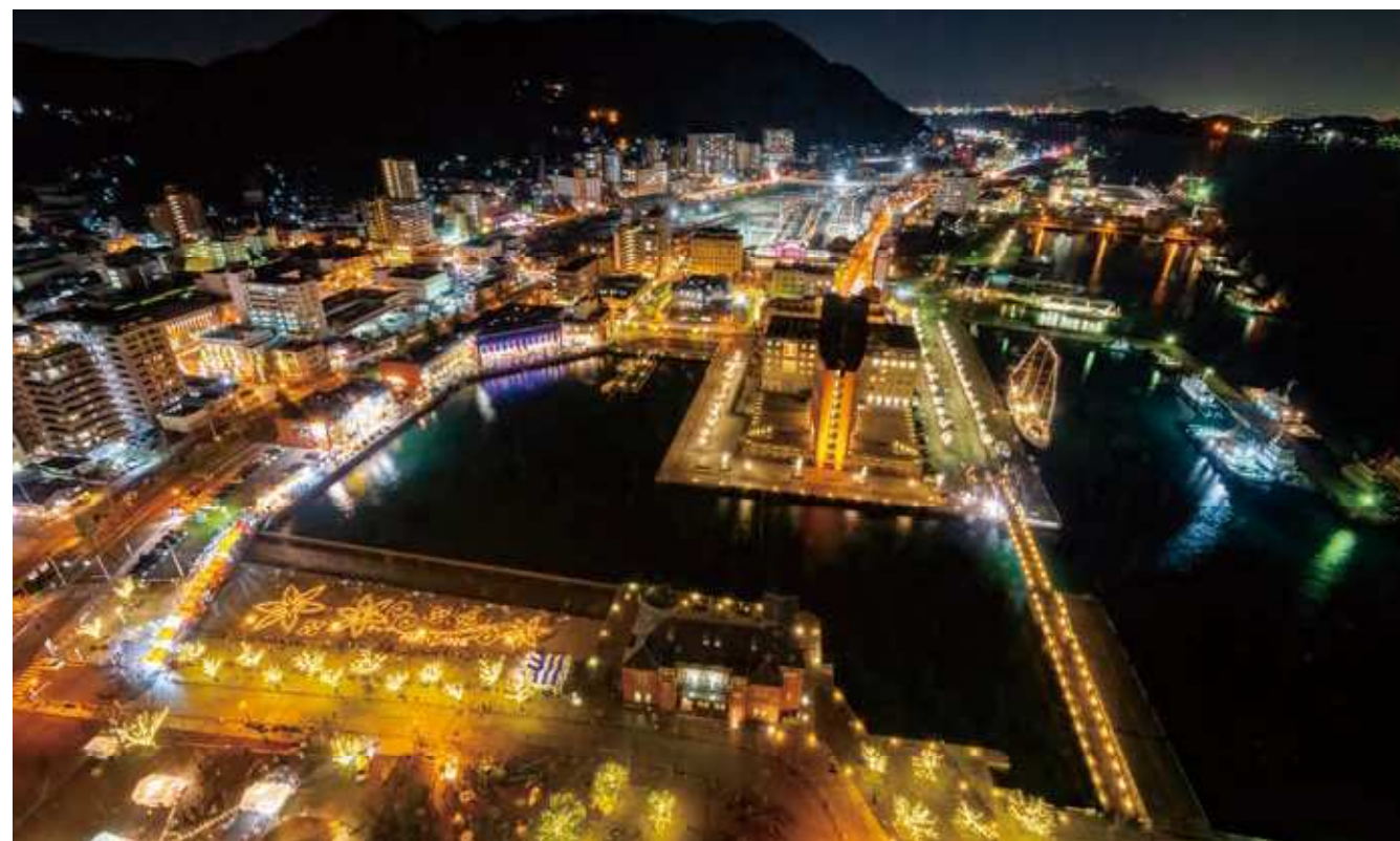
84 A view of dazzling lights at night from the Mojiko Retro Observation Deck

In 2018, the city of Kitakyushu was voted as “one of Japan’s three best cities for night views” by about 5,500 Nightscape Evaluators nationwide. While Kitakyushu possesses six night-scape heritage sites in Mt. Sarakura, Mt. Takato, Adachi Park, the Mojiko Retro Observation Deck, Kokura Illumination, and Tobata Gion Festival, new and attractive views are being created in succession as lights are installed to illuminate Kokura Castle, Wakato Bridge, and the Mojiko Retro district.