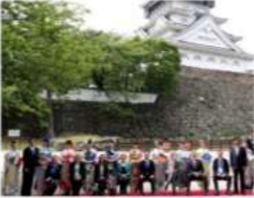
G7 Kitakyushu Energy Ministerial Meeting(May 2016)